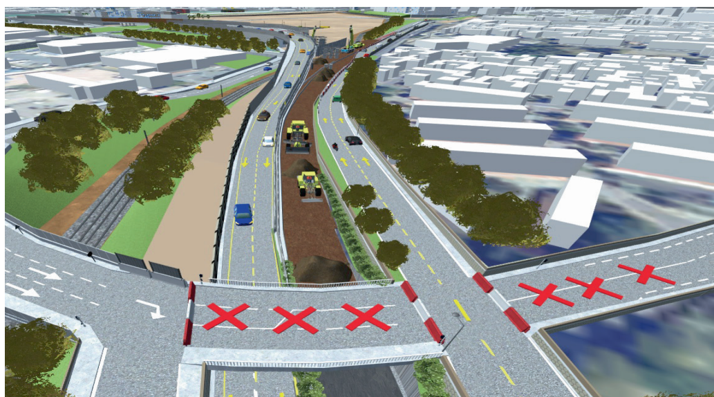
View of the A13 > Rouen direction from the Sud III expressway, at the Stalingrad junction at Petit-Quevilly.