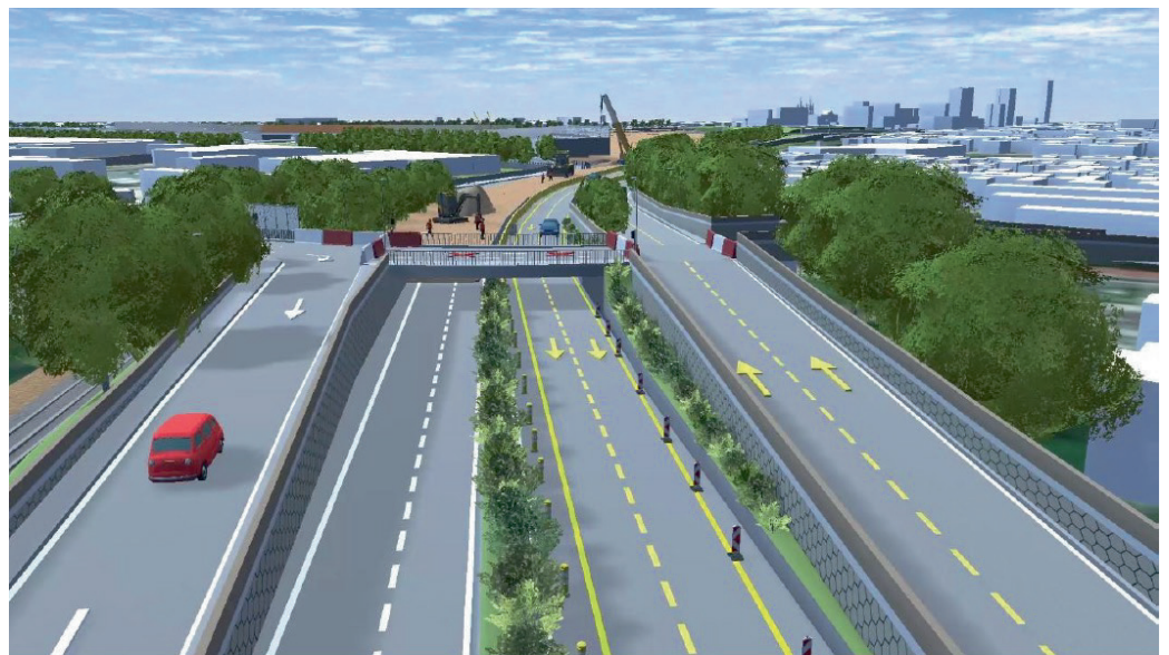
View of the A13 > Rouen direction from the Sud III expressway, at the Stalingrad junction at Petit-Quevilly.